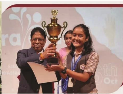
Unveiling Prayatna 2.0: The Ultimate Social Science Extravaganza!