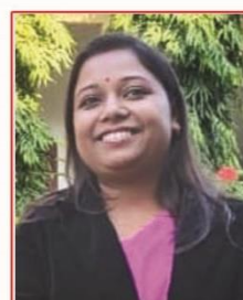
Jupitora Tamuly Education