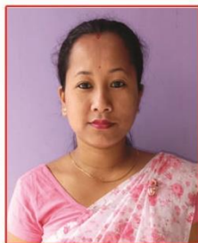
Kongkona Borah Statistics