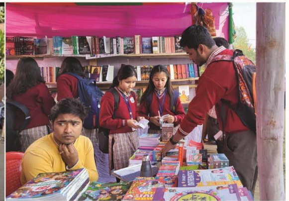
Visit to Kaziranga University